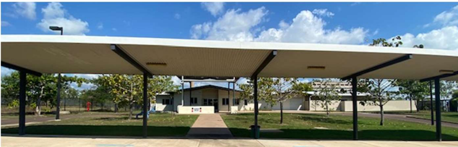
On-site accommodation support at Royal Darwin Hospital