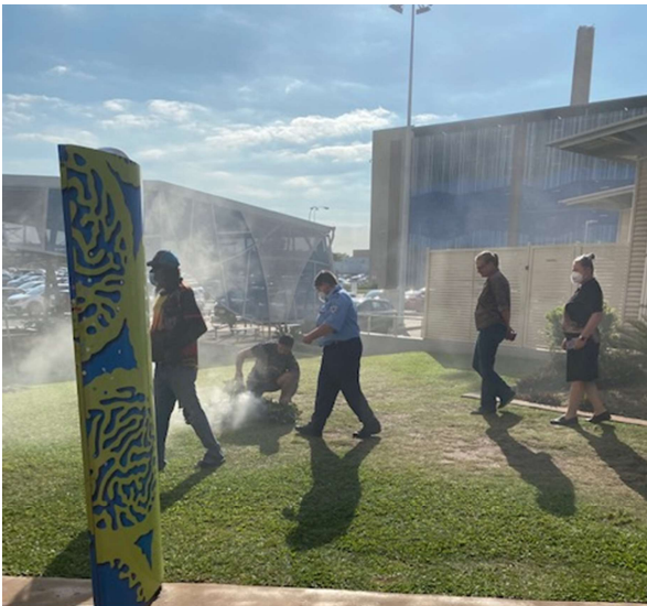
Smoking Ceremony at RDH

Travel to Darwin was for the purpose of interviews for the Aboriginal Outcomes Project. Several interviews were performed with families from Darwin and surrounds, including telehealth links for extended family in remote locations. Interviews with local clinicians were also undertaken. It was also an opportunity to reconnect and provide education with teams in person, as well as new team members from the paediatric and adult oncology services.