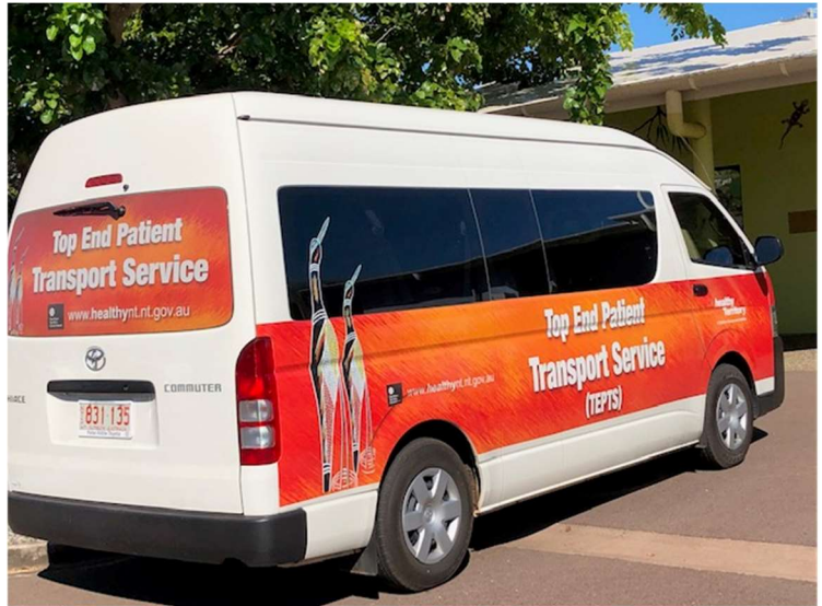
Patient transport assistance support