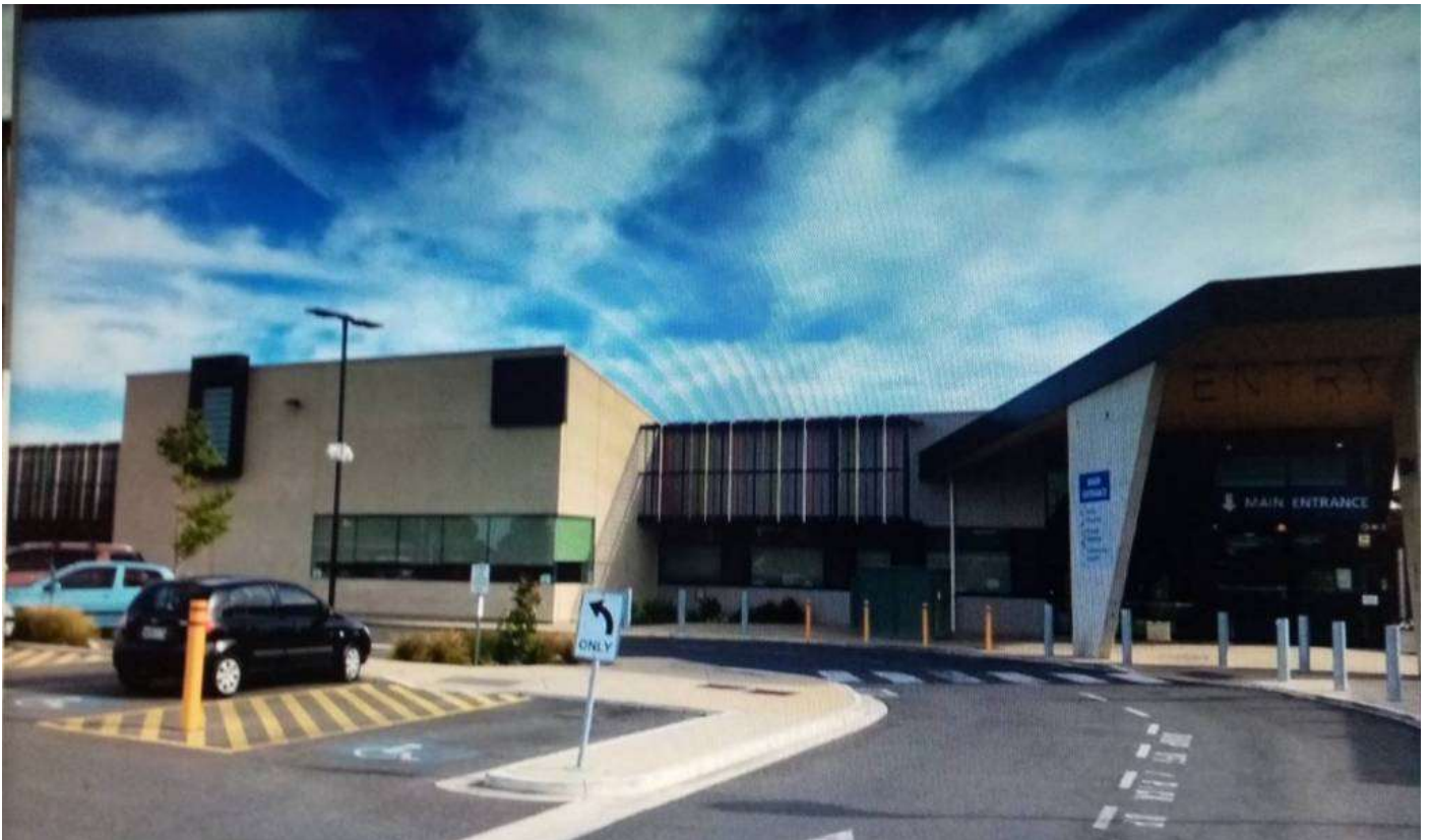
South Coast District Hospital in Victor Harbor (85Km From Adelaide)

This travel was for the purpose of education and training. Services within this regional area developed into community care agencies, as well as the South Coast District Hospital. Close liaison with the Cancer Care Coordinator at the South Coast chemotherapy unit has resulted in support from the local team to provide care for paediatric patients. Education was provided to the community care team regarding paediatric cancers, treatment, supportive care and use of central venous access devices (CVAD). This has enabled children to receive intravenous infusions and CVAD care within their own community, resulting in being able to stay within their own community and prevent daily travel into the Women's and Children's Hospital. The Greg Blewett Outreach Program is currently liaising with the South Coast chemotherapy unit to further upskill the team for paediatric care.