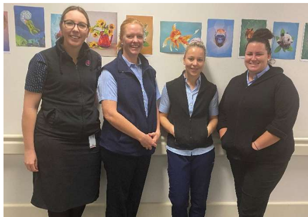
RDH nurses during clinical placement at WCH